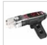
LightRay 200 Series generates dark field illumination