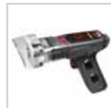
LightRay 100 Series generates off-axis diffuse illumination

Microscan's patented LightRay Optics solution further enhances the MS-Q's ability to read directly marked parts. By directing the illumination toward the symbol at off-axis angles, the LightRay Optics increase symbol contrast and filters out texture noise. The LightRay Optics are designed so that the MS-Q is positioned at the correct focal distance and angle. No training is needed to find the best angles for reading low contrast symbols. Either optical accessory easily attaches onto the end of the MS-Q. Two options are available: the LightRay 100 Series and the LightRay 200 Series.