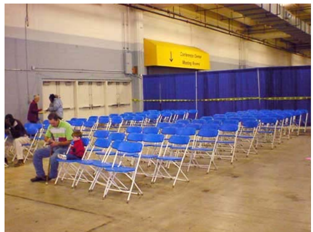
Fig. 7. Only a handful of recipients had to visit the Trouble Area, where wait times were slashed from 2 hours to less than 30 minutes.