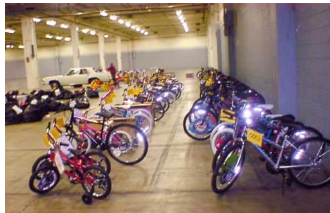
Fig. 4. Bicycles were given to children who met special program requirements

If the recipient's bag could not be located, the recipient was directed to the Trouble Area so a bag could be made. Last year, cars were lined up at Dock Drive-Up until past 7:00pm, and many recipients were told that they must go to the Trouble Area after waiting hours in the Drive-UP line. Pick-up appointments were more than an hour behind schedule and recipients were understandably agitated.