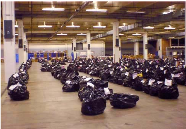
Fig. 3. Over 1700 toy & food bags await distribution day.

Cycle Count — A cycle count was performed at the end of the last bag packing day (December 20). The cycle count indicated that 27 bags were missing or not yet assembled. Missing bags were listed in a report for volunteers, who then created additional bags before distribution day arrived. Over 1700 bags were ultimately packed and ready for distribution day— December 22, 2003 (Fig. 3).