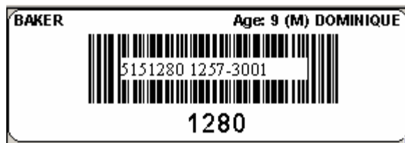
Fig. 1. Sample bag label.

1) Bag Labeling — All bags were tagged with bar code label(s) after being assembled by volunteers. The bag labels (Fig. 1) were created with LabelVision ® software and consisted of the parent's last name, the child's age/gender/ name, the last four digits of an assigned "Christmas Number," and a bar code with the child's "Angel Number." More than one label could be affixed to a bag to indicate gifts for multi-child families, and all bag labels would be scanned during Cycle Count and at Check Out.