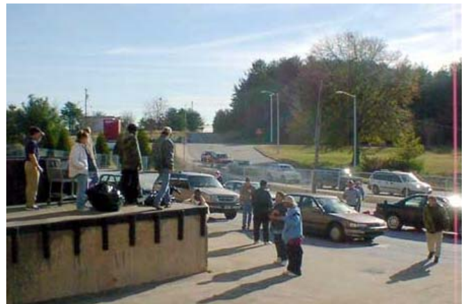
Fig. 6. Pick-up went smoothly as appointments were on or ahead of schedule.

At the end of the day (4:00pm), a report was run to show how many bags remained in inventory, allowing Salvation Army personnel to contact the families the following day to arrange pick up. Only 103 recipient bags (66 families) remained unclaimed out of 1,789 total bags.