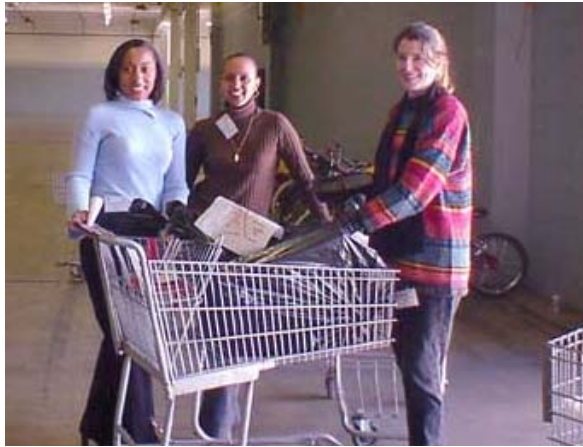
Fig. 5. Using a radio-frequency mobile computer provided by BarCode ID Systems, volunteers scan items at checkout.

With the 2003 program, cars arriving for pick-up slowed to a trickle by 2:30pm and pick-ups ended by 4:00pm. All pick-up appointments were on or ahead of schedule (Fig. 6).